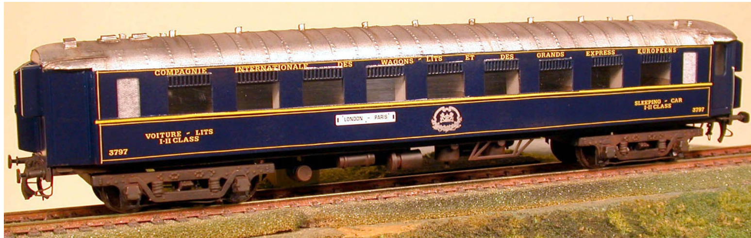
A finished model of the sleeping coach