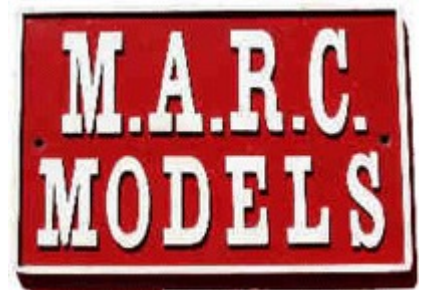
Image available soon

RTR £290.00 (delivery and/or collection to be arranged)